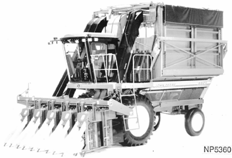
JOHN DEERE 9965 COTTON PICKER (MANUFACTURED 1993 - 1997)

(SPECIFICATIONS AND DESIGN ARE SUBJECT TO CHANGE WITHOUT NOTICE.)