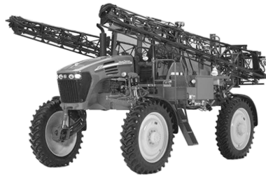
JOHN DEERE 4720 SELF-PROPELLED SPRAYER (MANUFACTURED 2004- )

(SPECIFICATIONS AND DESIGN ARE SUBJECT TO CHANGE WITHOUT NOTICE)