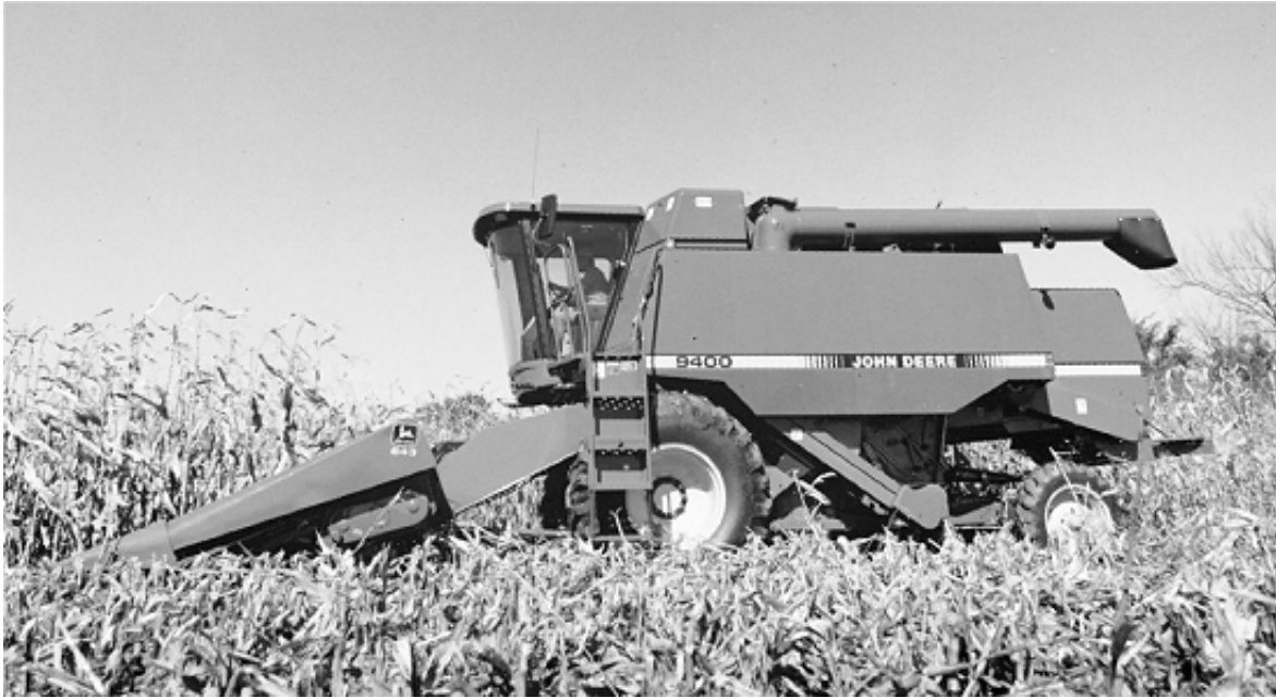
JOHN DEERE 9400 MAXIMIZER™ COMBINE